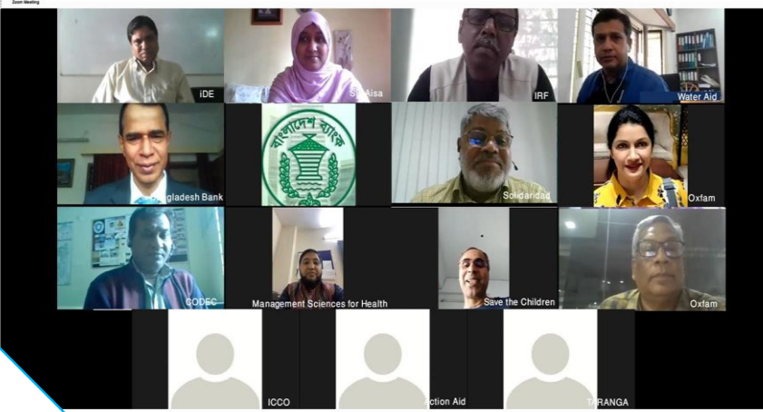
Consultation Meeting on International Fund Flow 07 December 2020

While some aggregated data on funding flows to local actors exists at the global level, there is limited knowledge of how much funding – and through what channels – goes to local actors at the country level, particularly funding that reaches local actors indirectly. Deeper analysis at the country level can provide useful information for humanitarian actors to make practical changes in humanitarian financing systems, and better meet commitments made through the Grand Bargain and other international agreements. The humanitarian sector has faced challenges for decades with how best to support and fund local responders. Implementing this ‘localization’